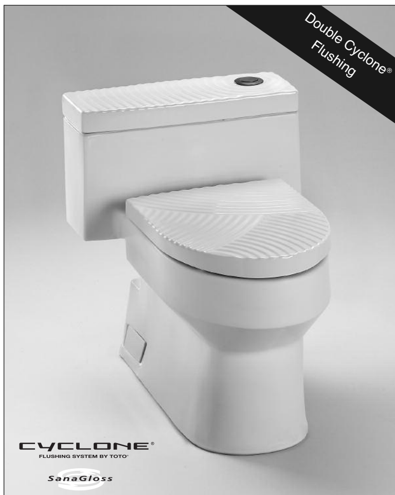
MS984244CFG - Ryohan Universal Height Toilet with SoftClose® Seat