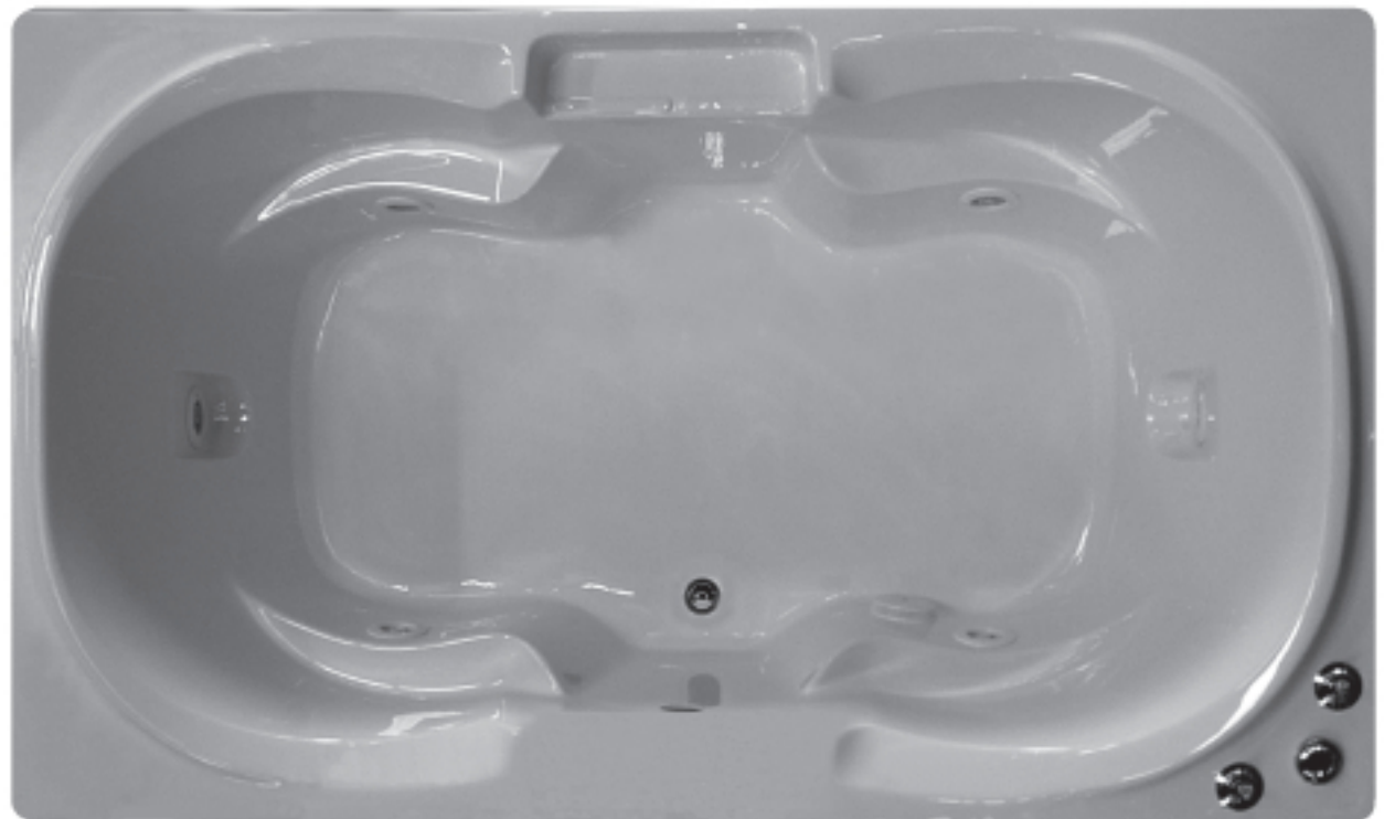
Shown with Standard Therapy Package and optional Fill-Flush.

NOTE: See electrical specifications page for electrical requirements of options.