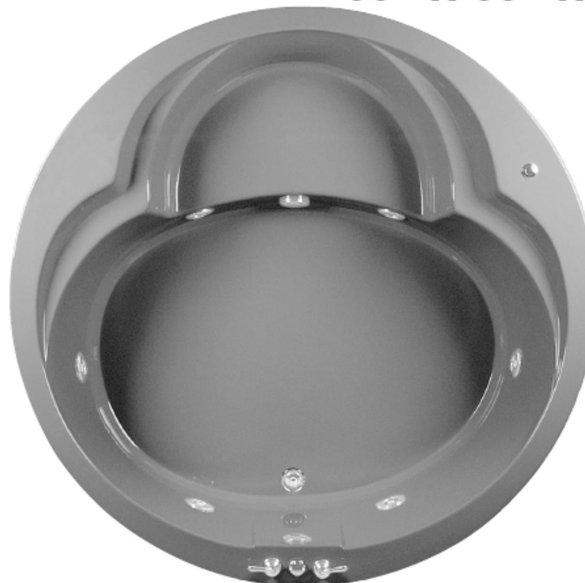
Shown with Standard Therapy Package and optional Fill-Flush.