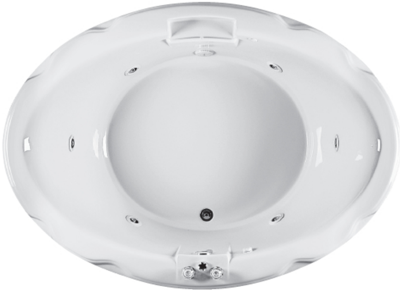
Shown with Standard Therapy Package and optional Fill-Flush.

CSA Certified C/US; NAHB Certified; ANSI Z124.1 for plastic tubs and ANSI 112.19.7 for whirlpool components. NOTE: See electrical specifications page for electrical requirements of options.