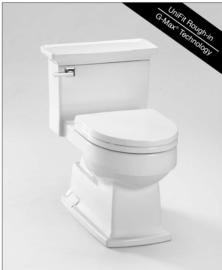
MS934214SF - Lloyd™ Toilet