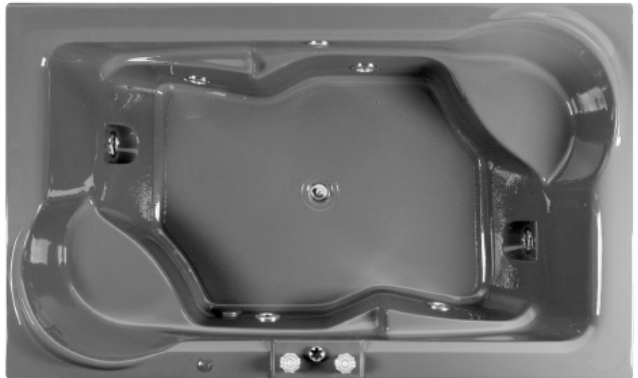
Shown with Standard Therapy Package and optional Fill-Flush.

NOTE: See electrical specifications page for electrical requirements of options.